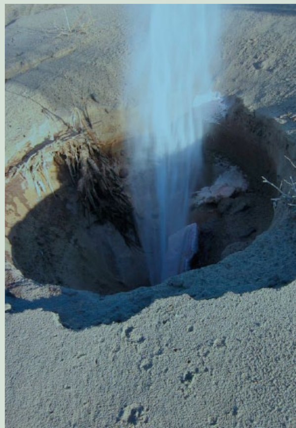
Kinder Morgan's oil pipeline ruptures in endangered species habitat in the Mojave Desert.

A Kinder Morgan subsidiary was subsequently convicted of six felony counts related to the Walnut Creek explosion and ordered to pay $15 million in fines. 47