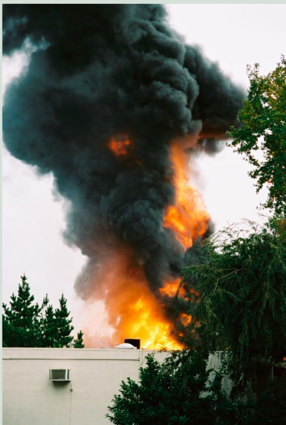
A ruptured Kinder Morgan pipeline in Walnut Creek, California killed five people when it exploded.

The most tragic Kinder Morgan mishap occurred in November 2004 when an excavator ruptured a high-pressure oil pipeline in the town of Walnut Creek, California. A welding torch then ignited the fuel, and five workers were killed as the pipeline erupted in a fiery explosion.